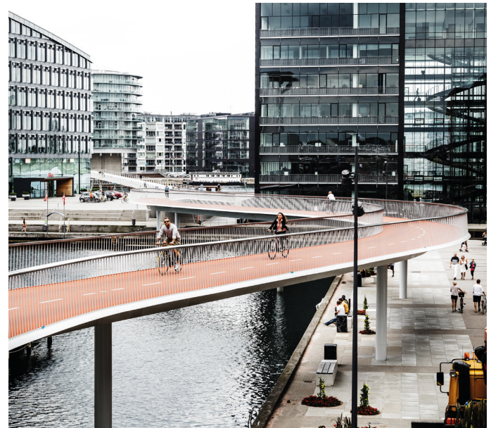
DISSING+WEITLING architecture, Photo: Rasmus Hjortshøj – COAST Studio

All participants will be assigned single rooms in the same hotel during workshops and their time in Sweden.